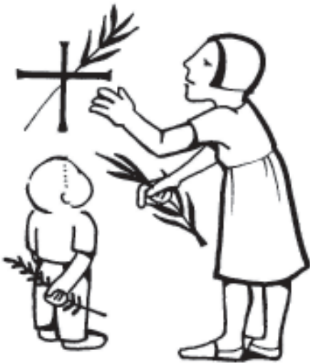
Bringing home palms

Watch over thy child, O Lord, as his/her days increase; bless and guide him/her wherever he/she may be. Strengthen him/her when he/she stands; comfort him/her when discouraged or sorrowful; raise him/her up if he/she falls; and in his/her heart may thy peace which passeth understanding abide all the days of his/her life; through Jesus Christ our Lord. Amen