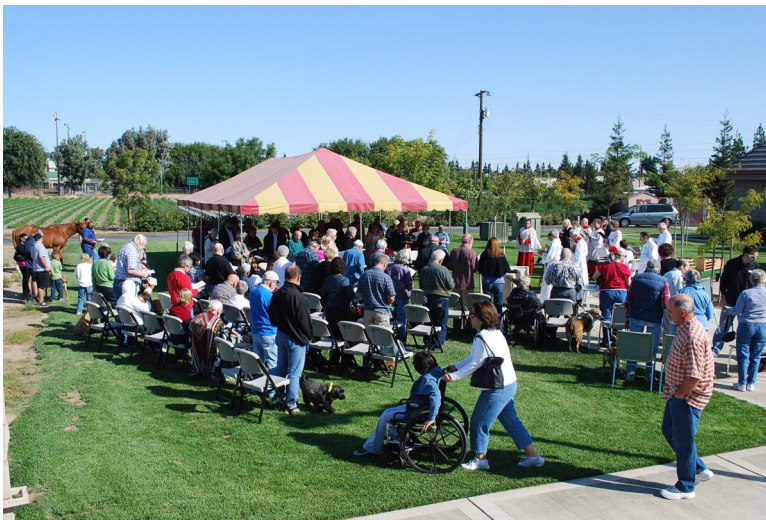
Blessing of the Animals 2009

Sunday October 17 will be the day of the Parish Picnic. While all the liturgical arrangements have yet to be worked out, this year's parish picnic will be coupled to a Ministry Fair. At last count, St. John's had around 27 ministries. Each one will have the opportunity to set up an exhibit table and talk about how they serve God and St. John's, as well as (hopefully) recruit new people. Learn about our array of outreach, spiritual formation, worship, fun and fellowship and other ministries, while having a grand old time at the parish picnic!