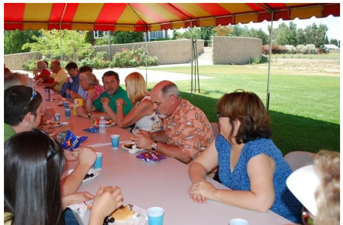
Parish Picnic 2009